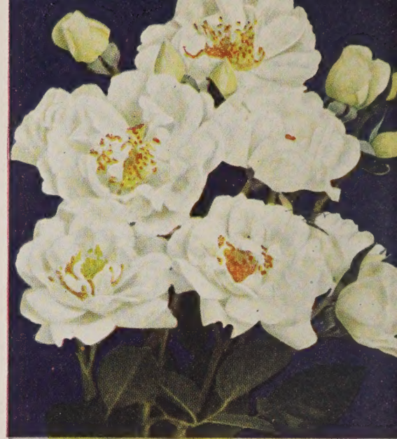
CITY OF YORK (Patent Pending)

CL. PASADENA TOURNAMENT (P.R.R.). A climbing sport of the beautiful small-flowered bush rose of the same name. The small, long pointed buds and very double flowers are useful in corsages or as boutonnières. A vivid velvety red of lasting color and continuous bloom. Each $2.00